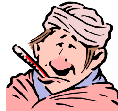
Don't exercise with a fever!