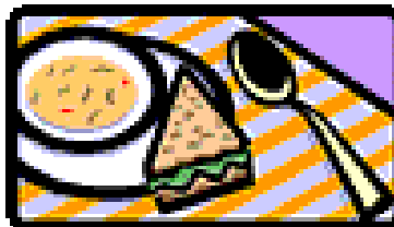
Simple changes with big results!